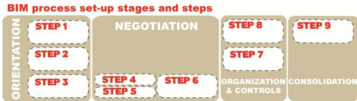
Figure 1-1 BIM process setup steps

The added value of a BIM-based delivery and operation process is spread throughout all its phases and can, therefore bring benefits to all actors involved in each stage. A particular aspect of the added value a BIM product can bring to the project is enabling optimized activities of analyzing, testing and validating the design before the project execution, thus saving a significant share of failure costs later in the building lifecycle [Eastman e.a., 2008], [Kiker, 2009].