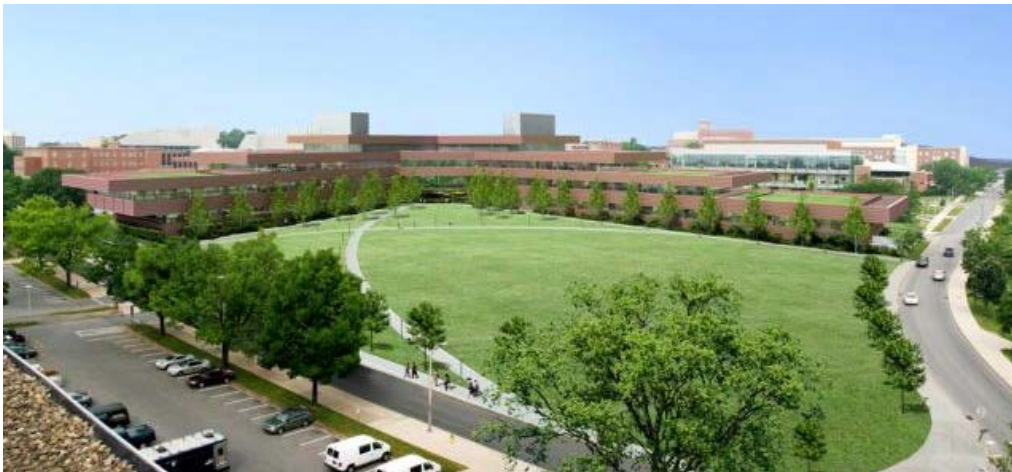
Figure 3: A model rendering of the Millennium Science Complex created by Viñoly Architects.

In order to test the integration process between the BIM platform and CMMS system, the OPP has chosen the Millennium Science Complex (MSC) as a pilot study. MSC, shown in Figure 4, is a 275,000 square foot, $230 million state-of-the-art research facility on the PSU University Park campus. The project is scheduled for completion during the summer of 2011. MSC will be the first PSU facility which will employ a full time building engineer and be maintained by a specific operative crew, which allows for maximum control of the data integration process.